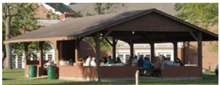
August Pitchin/Annual Meeting in Roberts Park

on a free Artzzy Party for kids ages 4-12. We had 20 children participate. It was a big success and we have been asked to continue this after the auction.